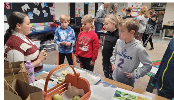
PII students learn about the pawpaw plant during harvest day.

with many more to come. Also new this year has been the addition of both 1st and 4th grade students to the Perry Ingenuity Institute. A 1st – 4th grade design learning school within a school, the Perry Ingenuity Institute (PII) is focused on making school responsive, personalized, and winnable. PII students learn at a level of where they are at instead of where they are supposed to be. This design allows students to both accelerate or receive remediated intervention at their own pace. You may find a mix of ages within these classrooms depending on the personalized educational pathways of each student. A human-centered design approach, PII is built on a mountain of teacher research along with contributions from national universities.