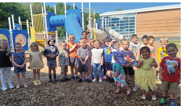
The preschool playground

PES uses building wide common assessments such as i-Ready, Panorama, DRA, DSA, etc. from which we collect high quality student data. That data is used to inform and drive instructional needs. Instruction at the K-4 grades include the nationally recognized and celebrated Benchmark Phonics, Heggerty Phonological & Phonemic Awareness, Eureka Math, and the Units of Study for Reading and Writing. Regardless of your child's learning environment, these district resources will be used with fidelity to ensure all Perry students learn and grow at a pace that is both comfortable and challenging. Should you ever have questions about our learning environments or the school, please reach out and let me know how I can support you and your young learner.